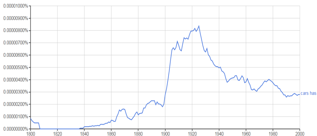
Figure 2. The use of 'cars has' in American English according to Google Ngrams

These nonstandard agreement patterns show that in colloquial American English the verb does not necessarily have to agree with the subject. Wolfram and Schilling (2016) note that a decisive factor which has contributed to the distinctive features of American English is the influence of other languages, from the Native American languages to the Scandinavian ones on the pronunciations of the Upper Midwest, to the influence of African languages on Ebonics. They further argue that even the languages of more recent immigrants from Asia and different Hispanic countries affect English in the same way as various European languages have done throughout the history of the US. Figure 2 reinforces the immigration hypothesis mentioned above. It is clear that the significant wave of migration to the US towards the beginning of the twentieth century has put its mark on the language used here.