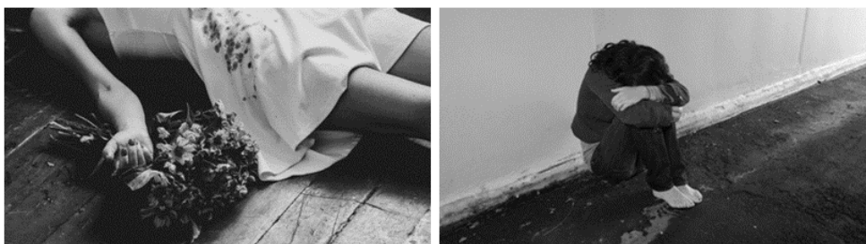
Figure 5: Women and sexual abuse during the Russian-Ukrainian war

The predominant theme in the category of social news is the sexual abuse of Ukrainian women by Russian soldiers, but it should be noted that journalists use metaphorical images in their discourse, where the women who suffered these horrific experiences cannot be individualized. The strong-weak opposition makes its presence felt in military conflicts because "the circumstances of war forcefully highlight human vulnerability, but the media's presentation of this vulnerability tends to be gendered. The media generally depict women as recipients of suffering, as beings acted upon by hegemonic forces which render them agentless" (Chetty 38). Painted as a symbol of vulnerability, women are neither exponents of individuality nor of collectivity, because the focus is not on the social actors but on the phenomena depicted, characterized by an emotional process . The black and white or dark-coloured images are intended to visually expose the irreparable physical and psychological suffering caused by sexual violence, both in general and during wars.