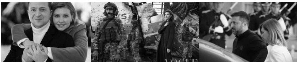
Figure 7: Various news: Olena Zelenska

As one can see in Figure 7 , Olena Zelenska is shown with her husband, and the tender gestures between them highlight the moral values they promote, focusing on the family nucleus. In this context, the ideology behind these images also emerges, that in crisis situations it is very important to be able to count on the support of those close to you. The image of wife is complemented by that of a model of feminine beauty who, from the shadow, offers support to those involved in the war. This can be seen in her nonverbal language, which conveys that she stands by the Ukrainian people. Olena Zelenska shows an emotional process , and the context in the images shows the duality of the military conflict that transforms the ordinary everyday life into a battlefield.