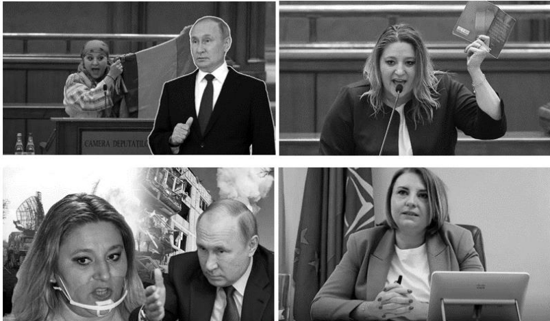
Figure 1. Women politicians in Romania

Maia Sandu, the President of the Republic of Moldova, is the foreign political figure who appears in official meetings with the Romanian president and the Ukrainian president. As these are official meetings, she represents the interests of her country and is captured in a material process , as these actions have a specific purpose, which is to receive assurances from foreign policy. The frame captured is specific to official visits, the political figures in the images are positioned next to the national symbols of the countries they represent, emphasizing the importance of alliances between the European countries. Apart from Maia Sandu, the other two politicians appear in a singular position in the images and are rendered through a verbal process or mental process , the background of the images being limited to abstract aspects that simulate identity. The presence in the foreground of the two symbolizes the role of spokesperson of national interests, their discourse being a firm one.