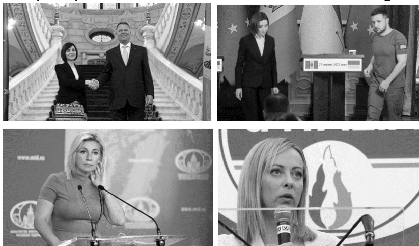
Figure 2. Women politicians from abroad

Maia Sandu, the President of the Republic of Moldova, is the foreign political figure who appears in official meetings with the Romanian president and the Ukrainian president. As these are official meetings, she represents the interests of her country and is captured in a material process , as these actions have a specific purpose, which is to receive assurances from foreign policy. The frame captured is specific to official visits, the political figures in the images are positioned next to the national symbols of the countries they represent, emphasizing the importance of alliances between the European countries. Apart from Maia Sandu, the other two politicians appear in a singular position in the images and are rendered through a verbal process or mental process , the background of the images being limited to abstract aspects that simulate identity. The presence in the foreground of the two symbolizes the role of spokesperson of national interests, their discourse being a firm one.