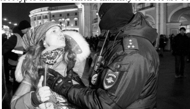
Figure 6: Women and protests against the Russian-Ukrainian war

and children lack the capacity to rebel, resist and shape their own history, persists in the media and news reports and are reflective of a discourse of silent agentless women suspended in a historical, social and economic vacuum" (Chetty 39). This erroneous perception of women's lack of capacity to rebel is evidenced in the Romanian media in the news reports on the protests in Russia against the invasion of Ukraine. Figure 6 shows the courage of the Russian protester in front of the police officer who tries to stop her from protesting. The woman is shown in the foreground, being individualized and presented in opposition to the police officer, representative of the collectivity by the professional category she represents. A verbal process is present in the image, the woman verbalizes her dissatisfaction and expresses her point of view regarding the situation of the Russian-Ukrainian conflict, and at the same time a material process can be observed, as the actions taken by her result in possible legal consequences. Through the use of a close framing an effect of veracity is achieved, arousing solidarity and a desire to act among the readers. This image, along with others depicting the woman as a protester, highlights the fact that stereotypes about women's inability to rebel are being dismantled.